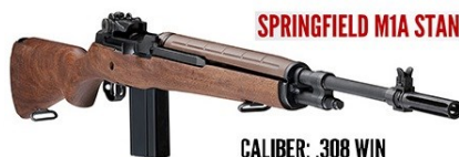
SPRINGFIELD M1A STANDARD CALIBER: .308 WIN