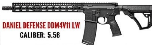
DANIEL DEFENSE DDM4V11 LW CALIBER: 5.56